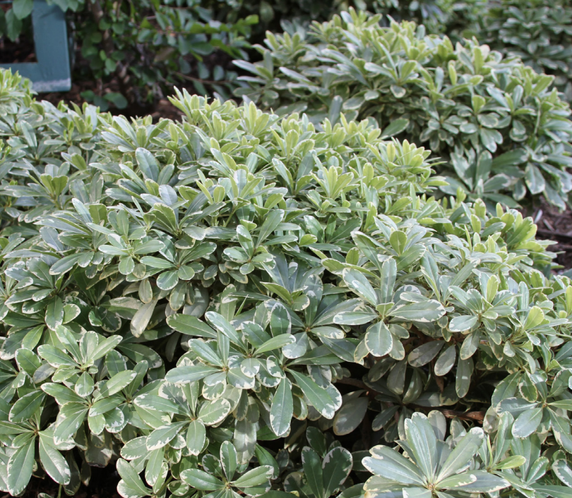
PITTOSPORUM TOBIRA 'CREAM DE MINT' (CREAM DE MINT PITTOSPORUM) HEIGHT: 2' - 2.5' SPREAD: 2' - 2.5'