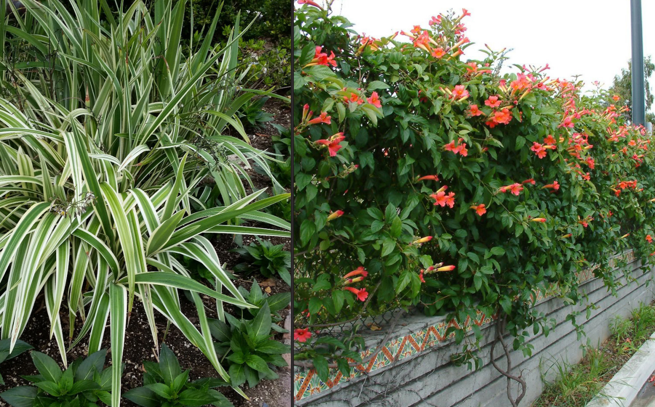
DISTICTIS BUCCINATORIA (RED TRUMPET VINE) HEIGHT: 2' - 3' SPREAD: 2' - 3' WUCOLS: M