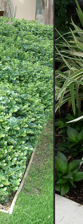
DIANELLA TASMANICA 'VARIEGATA' (VARIEGATED FLAX LILY) HEIGHT: 42" SPREAD: 12"