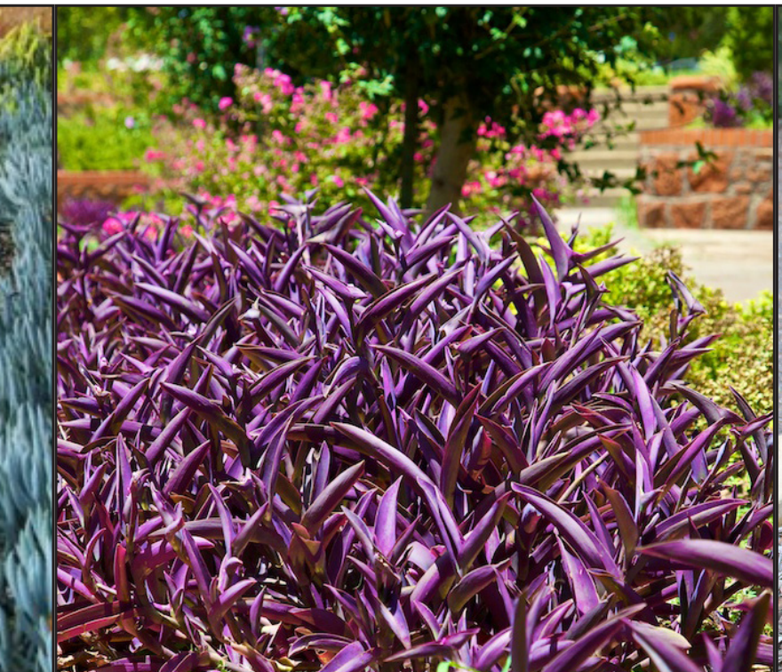
TRADESCANTIA PALLIDA 'PURPLE HEART' WESTRINGIA 'BLUE GEM' (PURPLE HEART WANDERING JEW) HEIGHT: 12" SPREAD: