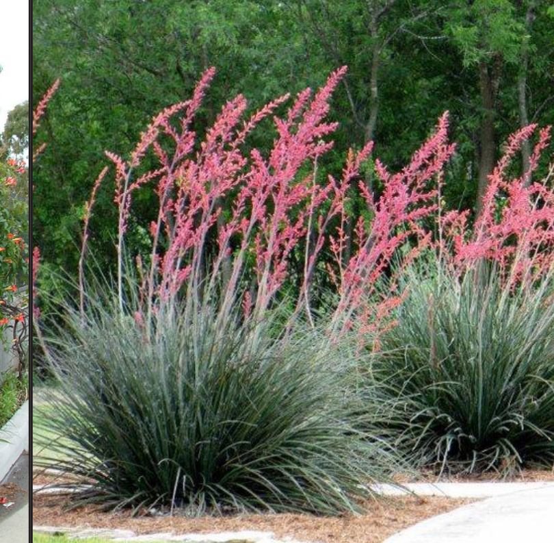
HESPERALOE PARVIFLORA (RED YUCCA) HEIGHT: 3' SPREAD: 5'