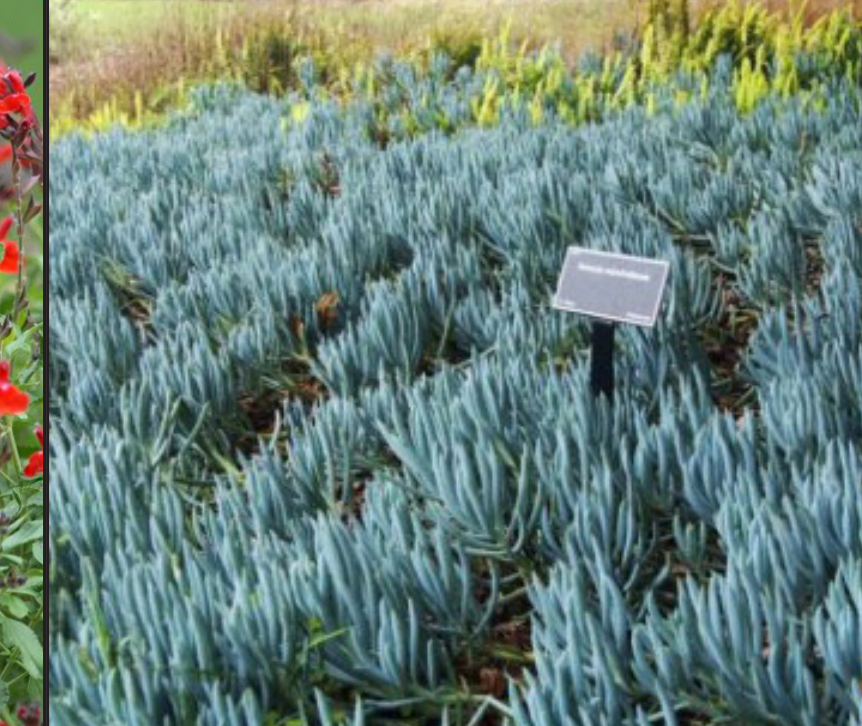
SENECIO SERPENS (BLUE CHALKSTICKS) HEIGHT: 1' SPREAD: 2' - 3' WUCOLS: L