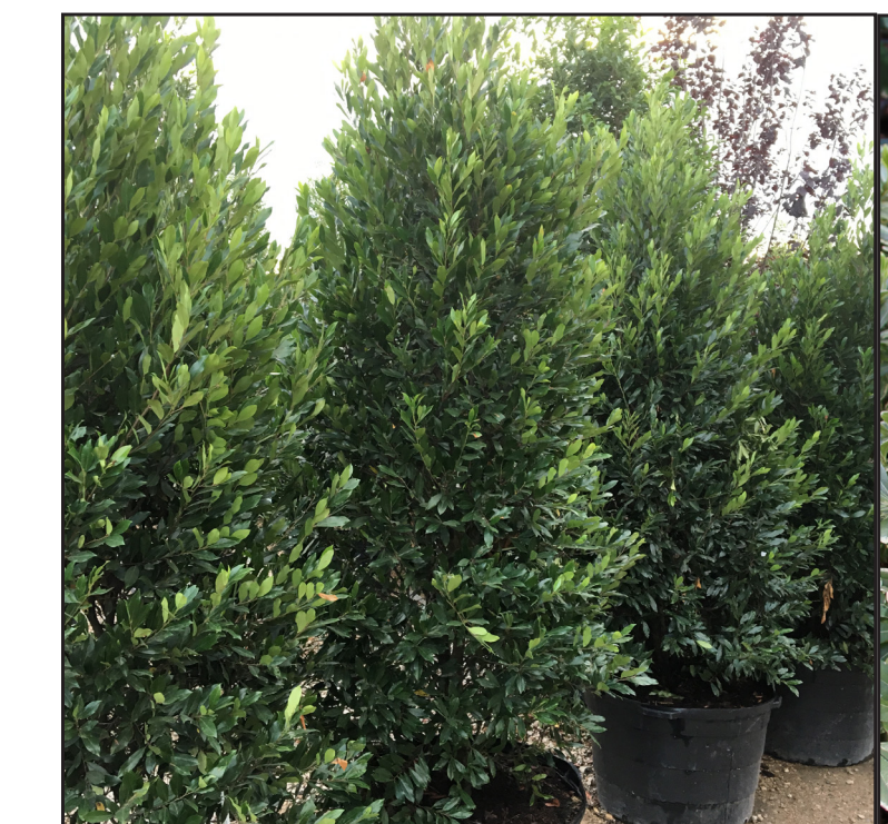
PRUNUS CAROLINIANA COMPACTA (DWARF CHERRY LAUREL) HEIGHT: 8' - 10' SPREAD: 6' - 8' WUCOLS: M