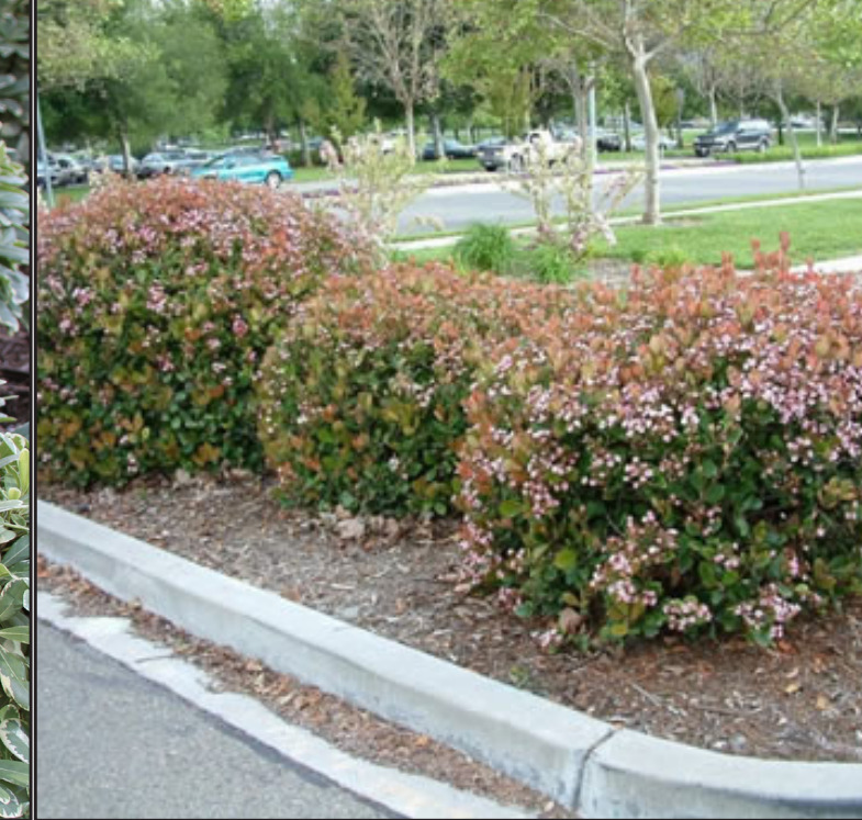
RHAPHIOLEPIS INDICA 'CLARA' (INDIAN HAWTHORN CLARA) HEIGHT: 4' - 5' SPREAD: 4' - 5'