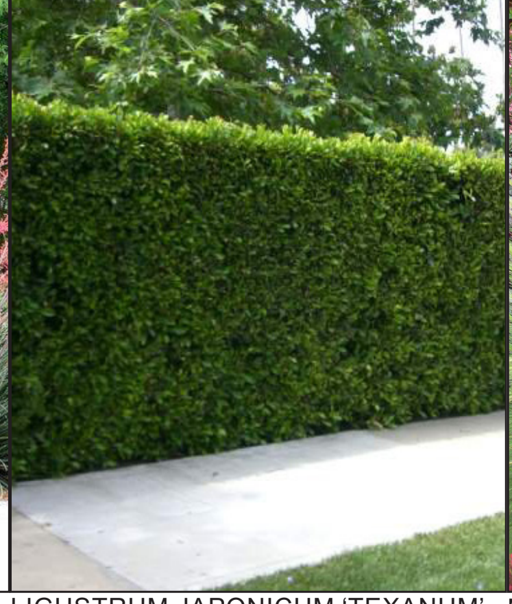
LIGUSTRUM JAPONICUM 'TEXANUM' NASSELLA TENUISSIMA (WAXLEAF PRIVET) HEIGHT: 8' - 10' SPREAD: 4' - 6'