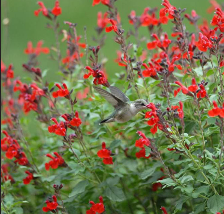
SALVIA GREGGII (AUTUMN SAGE) HEIGHT: 2' - 3' SPREAD: 2' - 3'