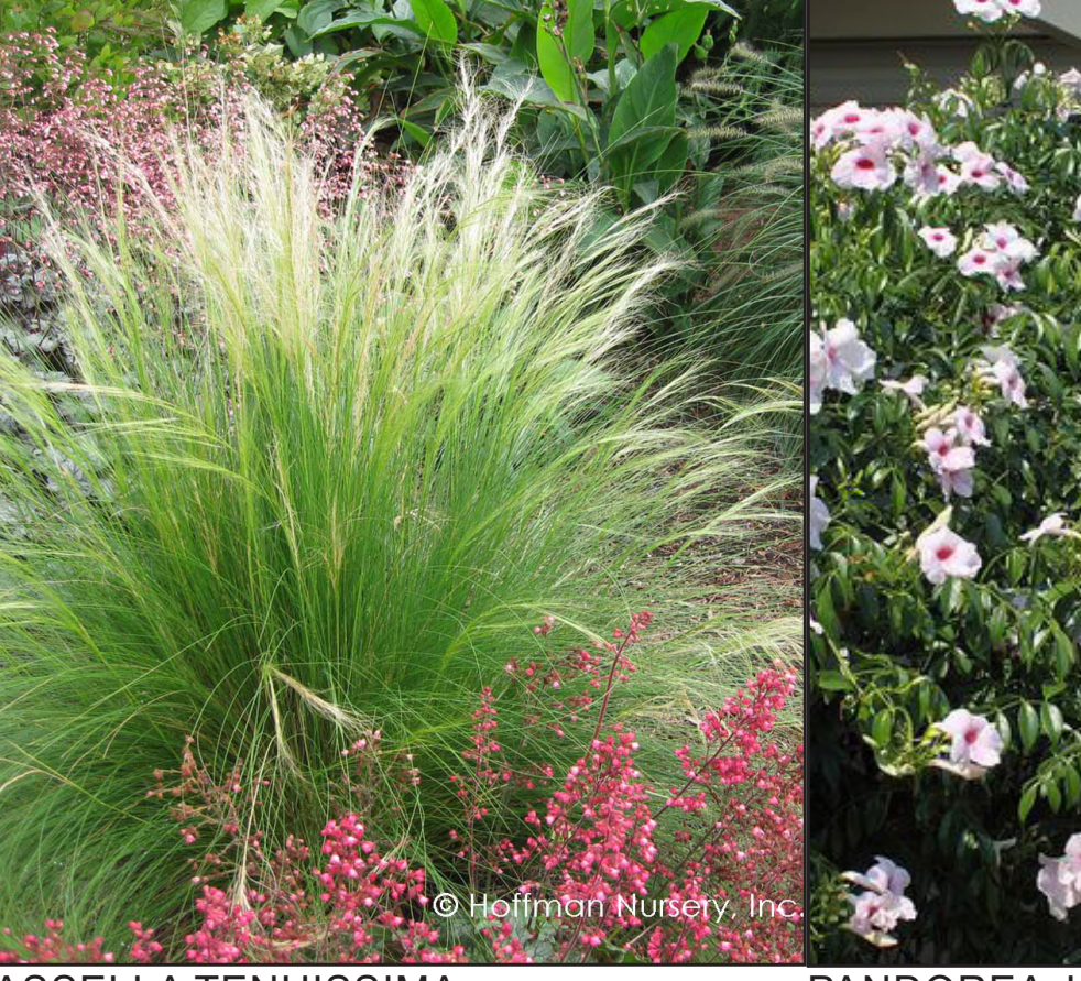
(MEXICAN FEATHER GRASS) HEIGHT: 1' - 24' SPREAD: 2.5'