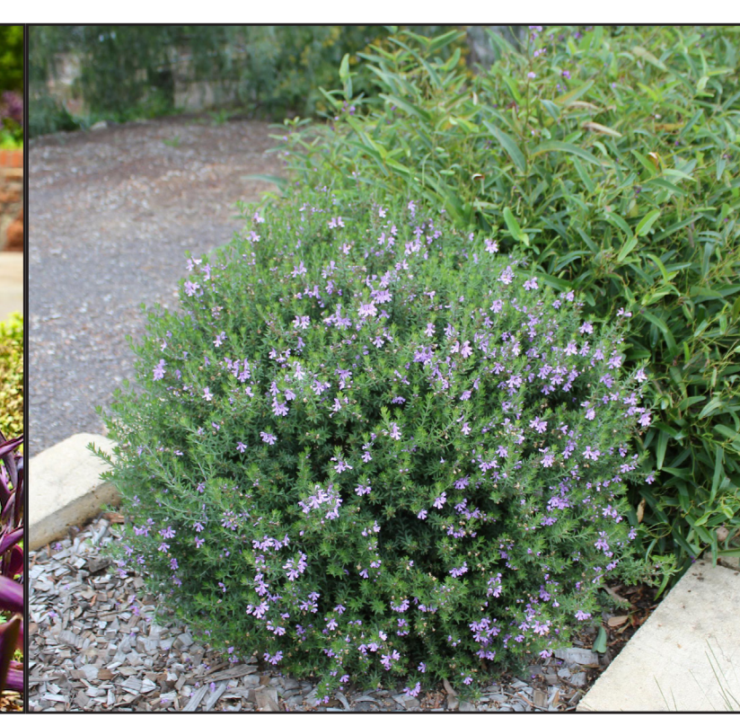
(BLUE GEM WESTRINGIA) HEIGHT: 6' - 7' SPREAD: 6'