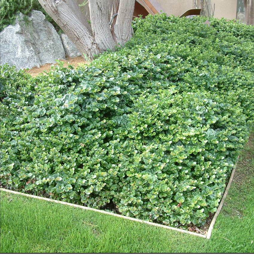
CARISSA MACROCARPA 'GREEN CARPET' (GREEN CARPET NATAL PLUM) HEIGHT: 12" - 15" SPREAD: 4' - 5'